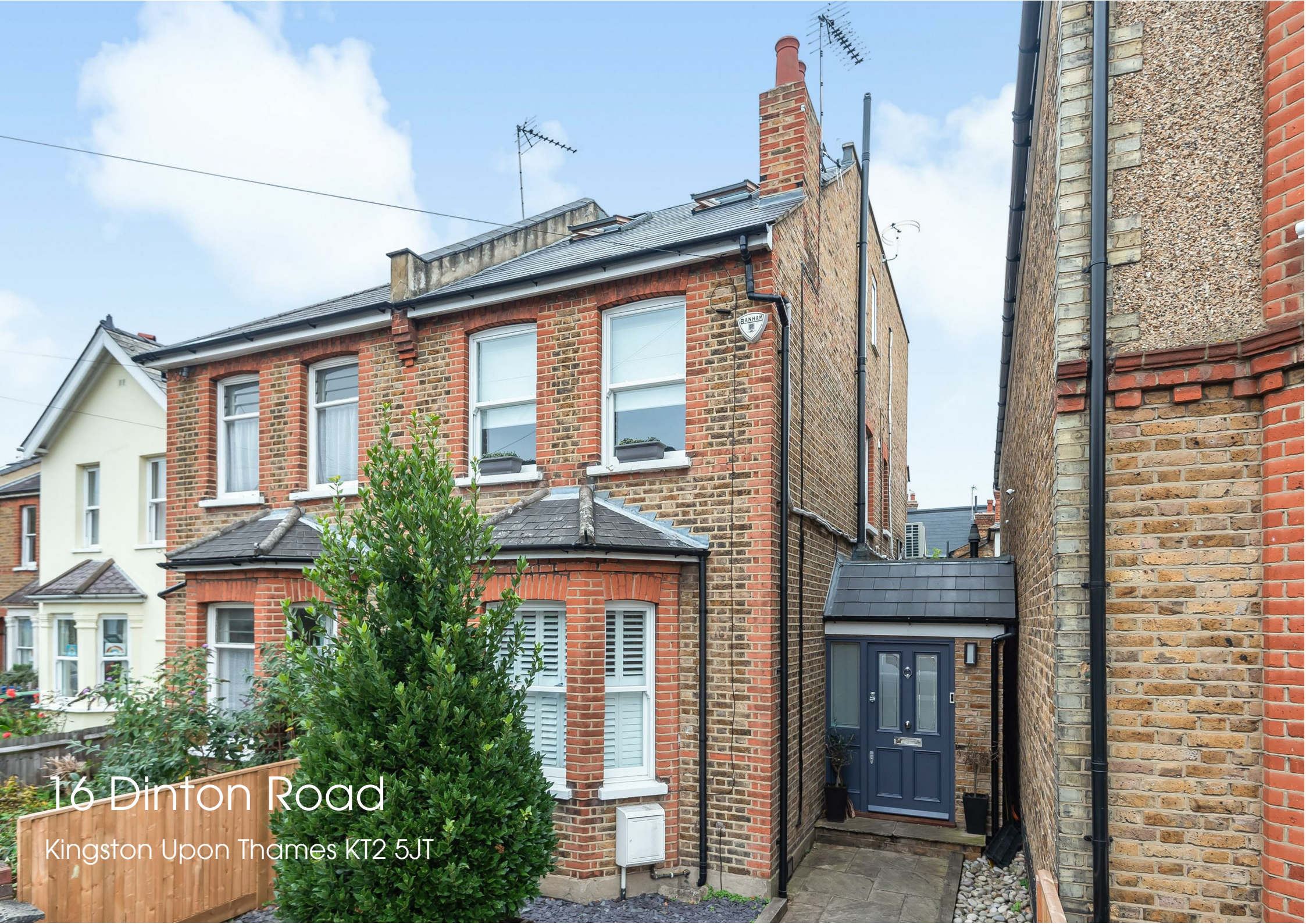
16 Dinton Road Kingston Upon Thames KT2 5JT